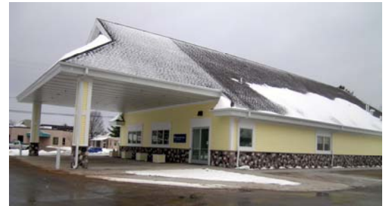
Kalkaska Memorial Dialysis Center

The new facility represents the hospital's commitment to meeting patient care needs close to home.