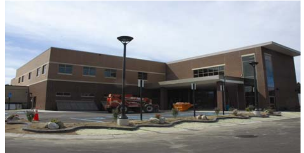
Kalkaska Memorial Health Center

The new structure at Kalkaska Memorial Health Center offers patients a convenient registration process and an expanded Radiology Department with comfortable, private changing rooms for men and women as well as a new digital mammography suite. The facility provides a 12-exam-room Rural Health Clinic which is used for special programs including hosting specialists from Traverse City for half-day and full-day clinics. Also, two new surgical suites will be available for colonoscopies and cataract surgeries, and a new Cardiac Rehab area features an indoor walking track.