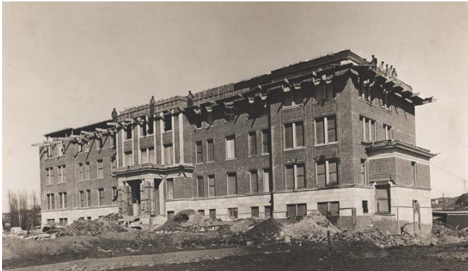
The former Bell Hospital takes shape in 1917.