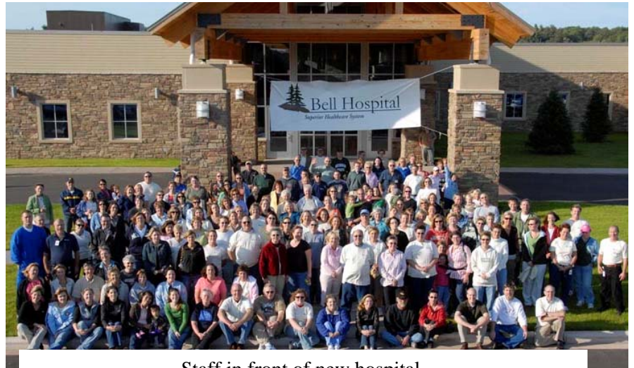
Staff in front of new hospital.