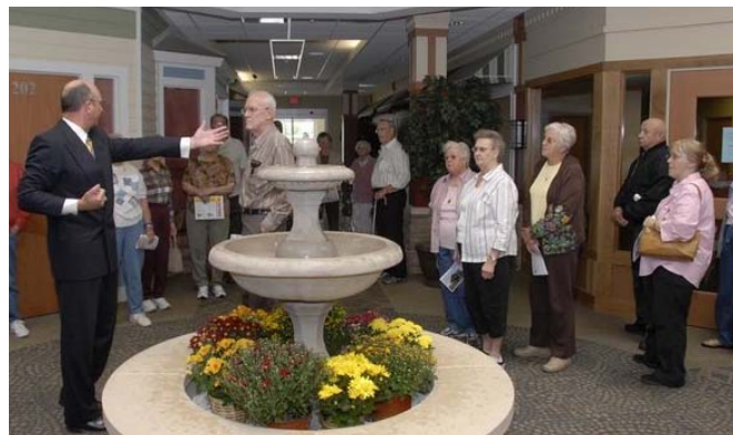
Touring the new building.