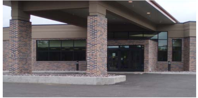
Main Entrance Munising Memorial Hospital & Health Services

The new 57,000 square-foot facility overlooks Lake Superior. It was designed to accommodate growing demands for outpatient services and is connected to the Bay Care Medical Center, a 17-unit assisted living facility. The Hospital is now an efficient size from 25 to 11 beds and remains financially stable to meet area needs.